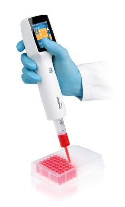
Multi dispensing with the HandyStep® touch and PD-Tip II

The HandyStep® touch saves time and prevents errors through automatic tip size recognition of the PD-Tips II from BRAND, with patented coding on the pistons. After inserting the tip, the size is automatically recognized and displayed, making it easy to select the volume to be dispensed. When a new PD-Tip of the same size is inserted, all instrument settings are maintained.