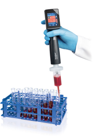
Sequential dispensing with the HandyStep<sup>®</sup> touch S and PD-Tip II